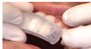
Patient Approved Provisionals A clear matrix allows for a true smile preview