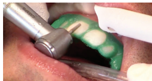
Complex Cases Made Simple Templates expose where and how much to contour